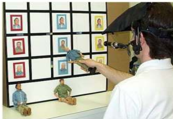
Figure 1. Runner et al. (to appear) display.

The availability of a coreferential interpretation under ellipsis in examples like (18) and (17b) provides our first argument against treating the possessor as part of the ARG-ST of the picture noun.